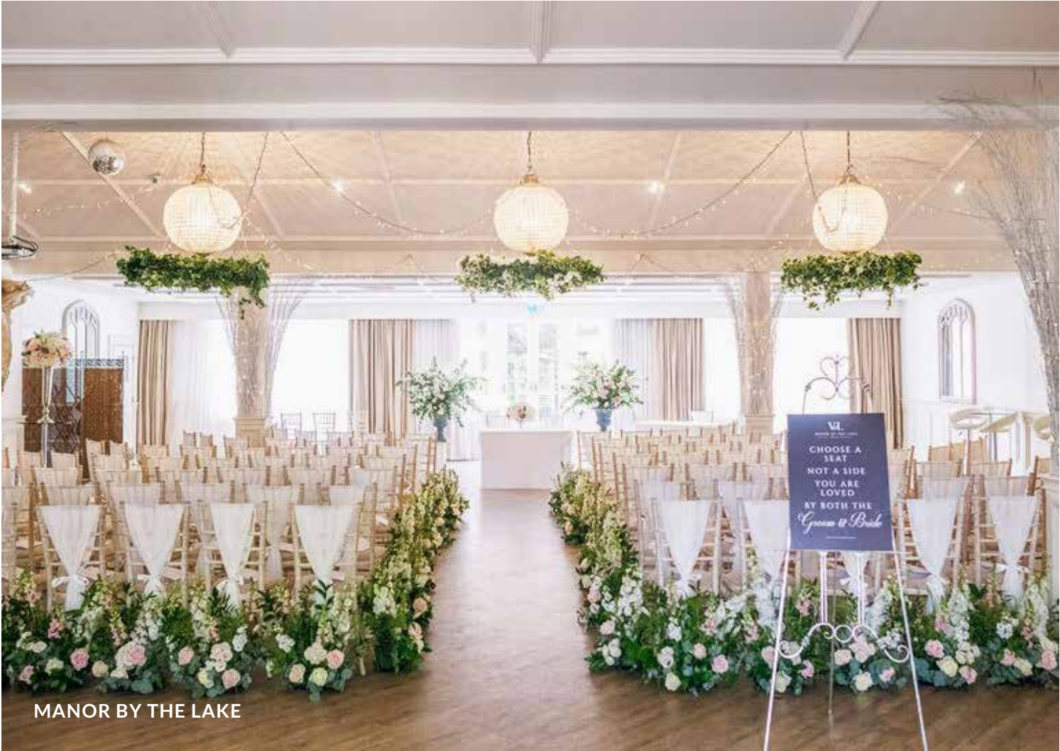
MANOR BY THE LAKE

From mouth-watering three-course feasts to sumptuous suppers, sizzling street food to scrummy wedding breakfasts, it's all possible at Manor By The Lake. Dazzling sparklers, bouncy castles, drinks on the terrace, a live band or some classic party games by the fire - simply tell us what you're looking for and we'll make it happen.